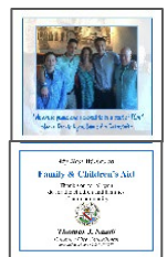
HALF PAGE ADS